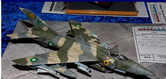
1/48 Nanchang A-5C of PAF by Ian Gaskell