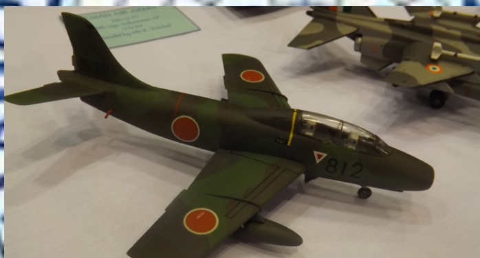
1/72 Fuji T-1 of JASDF by Paul Irving