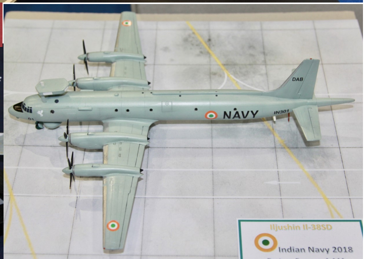
Iljushin Il-38SD Indian Navy 2018 Eastern Express 1:144