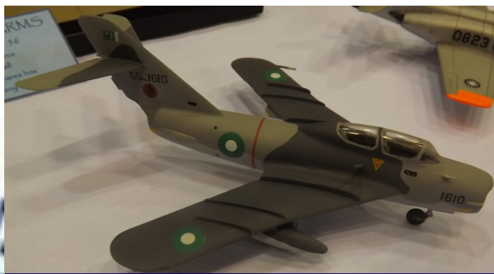
1/72 Chengdu FT-5 of PAF by Paul Irving