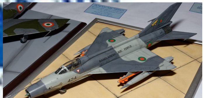
Chengdu F-7MB of Bangladesh Air Force by Craig Godwin