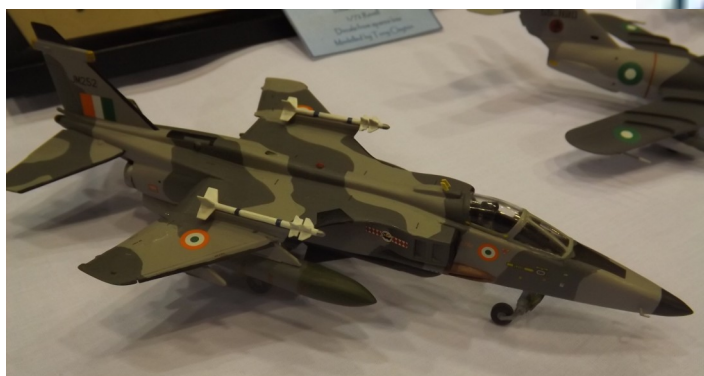
1/72 HAL Shamsher/BAe Jaguar of IAF by Paul Irving