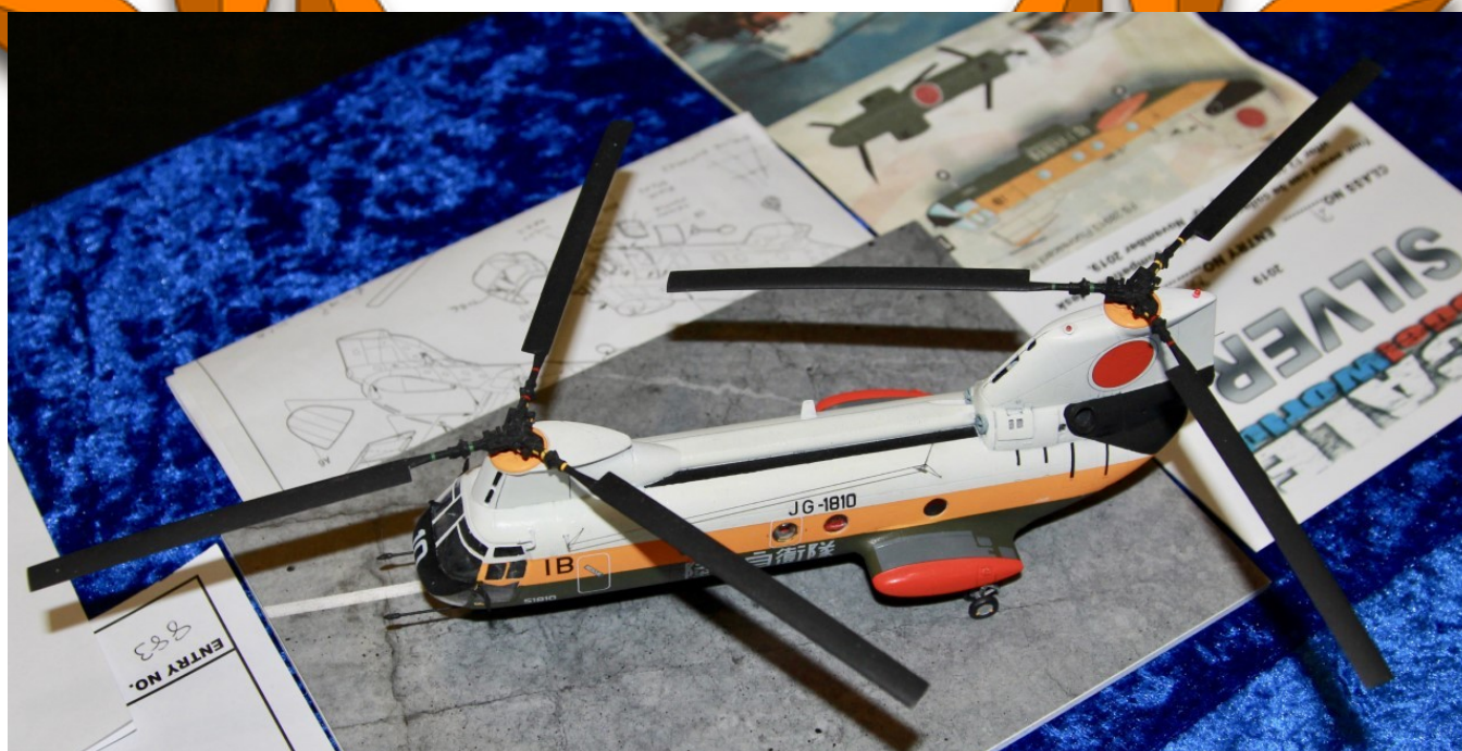
1/72 Kawasaki Vertol "Sea Knight" JMSDF