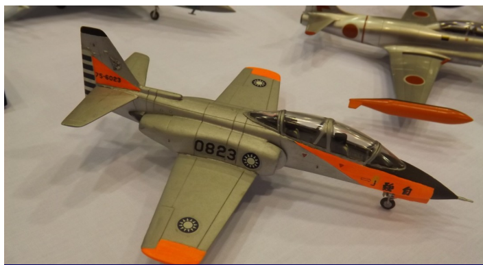
1/72 AIDC AT-3 of ROCAF by Paul Irving