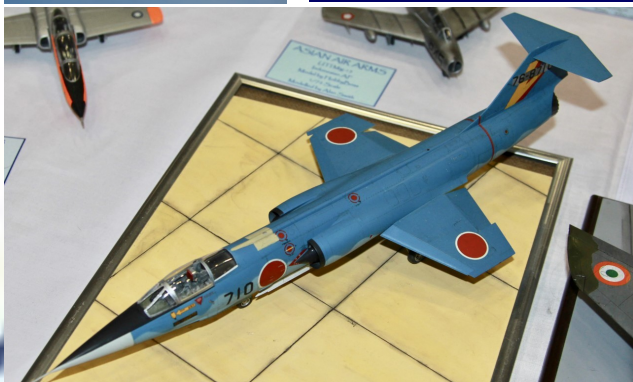
1/48 F-104J of JASDF by Craig Godwin