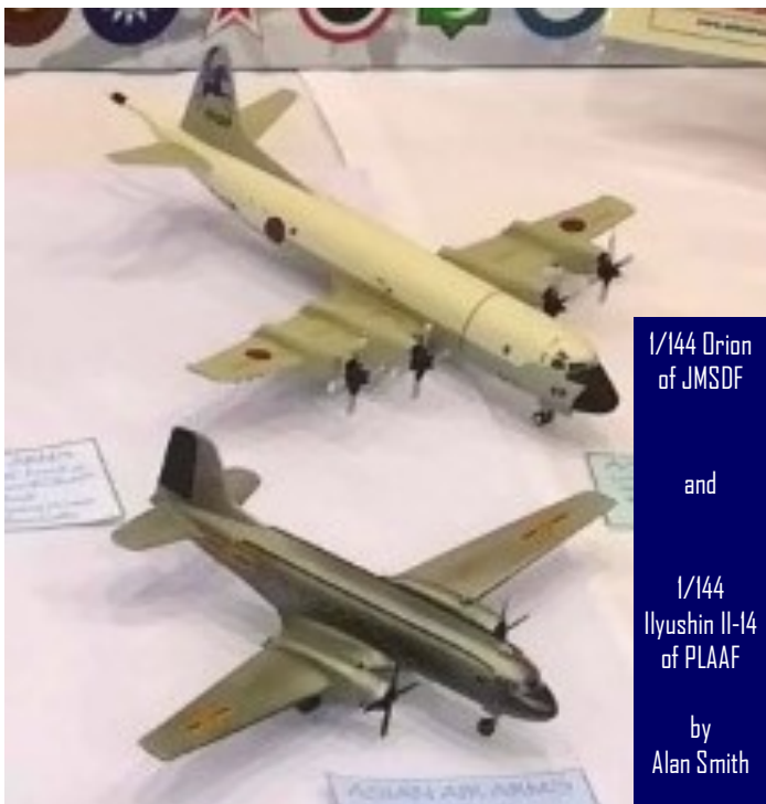
1/144 Orion of JMSDF