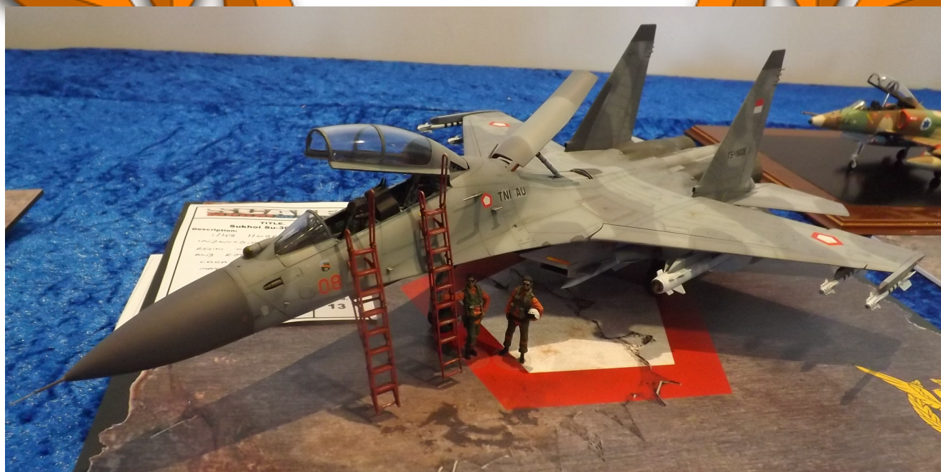
1/48 Sukhoi Su-30MK2 Indonesian Air Force (TNI-AU)