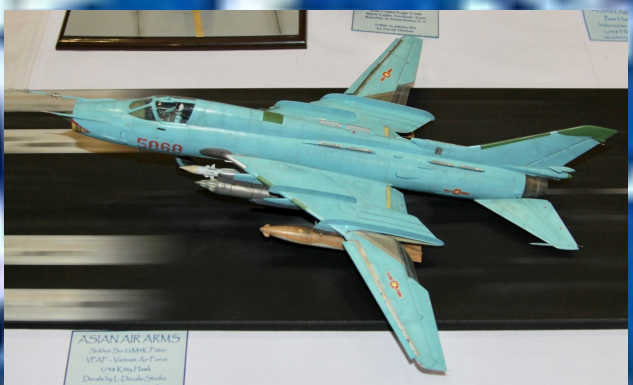
1/48 Sukhoi Su-22M4 of VPAF by Markus Wuellner