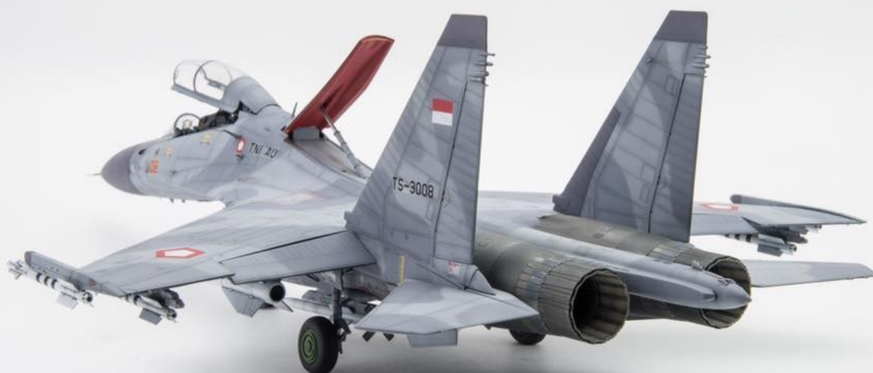
Sukhoi Su-30MK2—Indonesian Air Force (TNI—AU)