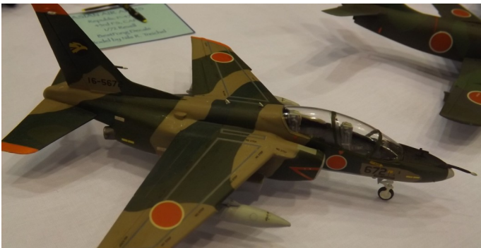
1/72 Kawasaki T-4 of JASDF by Paul Irving