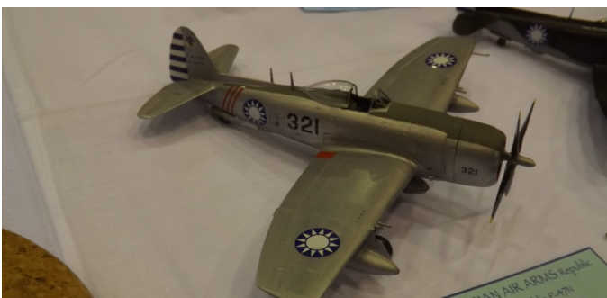
1/72 P-47 Thunderbolt of ROCFAF by