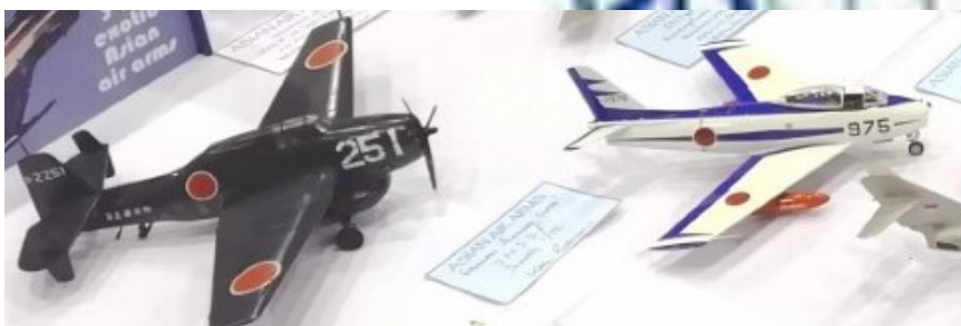
1/72 Skyraider AEW (JMSDF) & 1/72 JASDF Blue Impulse F-86 by Karl Robinson