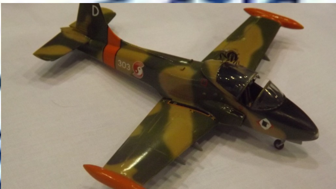
1/72 BAC Strikemaster Mk.82 of RSAF by Matt Hale